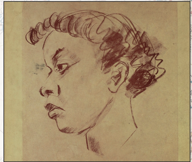
Exhibit will be on display through May 2025